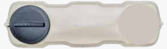
1,000L top view

A 300mm lid is fitted for ease of inspection and cleaning